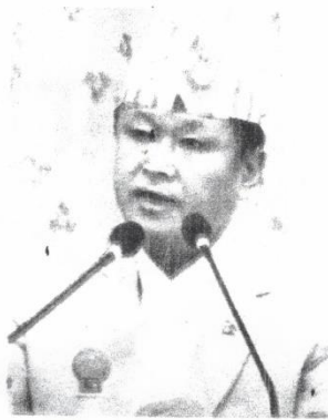
प्रतिबद्धता पनि जनाउनुभयो।